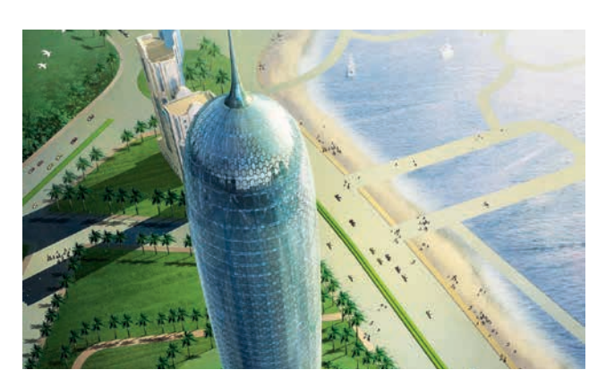
Doha High Rise, Doha, Qatar