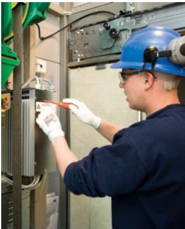
Our experienced modernization teams make sure the job is completed on time and on budget.